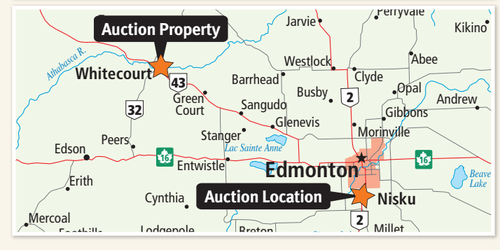
Directions to Property 4011/4015 38 Street, Whitecourt, AB